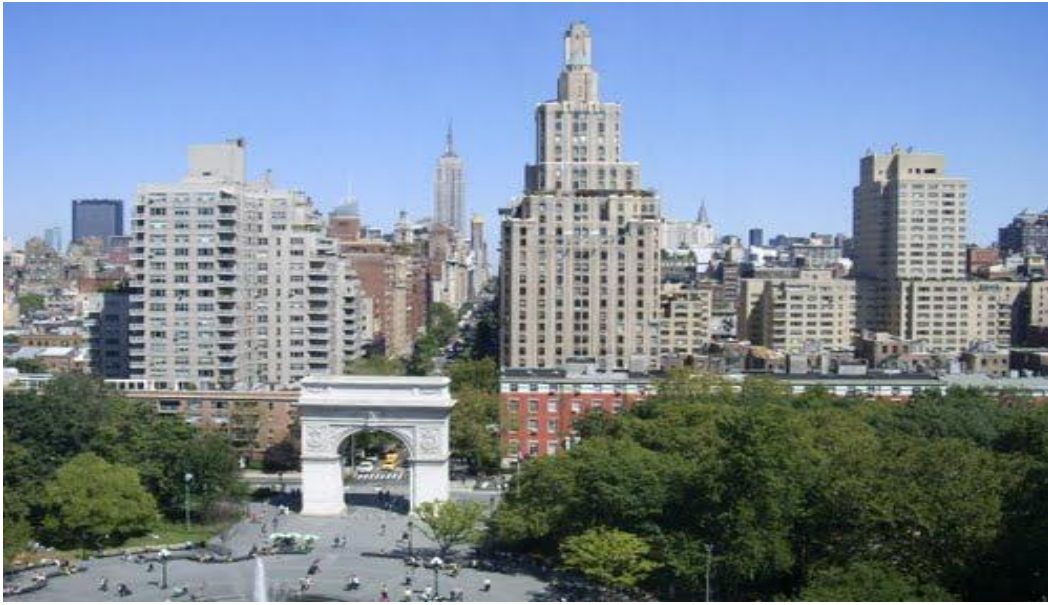
Actual view from the conference space at the NYU Kimmel Center

Drawing upon the same location and housing resources engaged for the 2007 ADPCA conference, we plan to retain New York University's Kimmel Center ( http://www.nyu.edu/life/resources-and-services/kimmel-center.html ) as the conference site. We plan to draw upon the NYU dorms for low cost accommodations in New York City, as well as local area hotels for additional accommodations. All of these accommodations are in walking distance to the conference site. The conference site and accommodations are all handicapped accessible and have onsite cafeterias. The site is located in New York City's Greenwich Village, overlooking Washington Square Park; therefore there are many world-renowned venues for food and entertainment in the area. Some well regarded points of interest include: the National September 11th Memorial, Blue Note Jazz club, The New Museum, the "Sex and the City" walking tour, Broadway and Off-Broadway shows, as well as many shops for clothing, books, and gifts. Additionally, there is easy access from JFK, LaGuardia, and Newark airports to the conference site, and the site is central to all forms of public transportation.