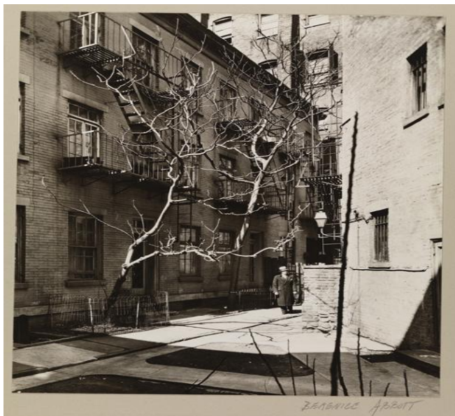
Vintage photo of NYPCRC Office Site

“Your team did a wonderful job hosting ADPCA 2007. Your committee was thoughtful, generous, available, and responsible. I felt that the committee's agility and care left participants comfortable and free to maximize the opportunities of the conference and New York City.”