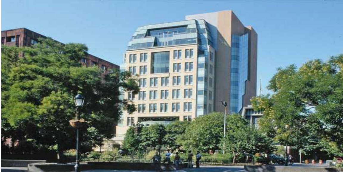
The NYU Kimmel Center